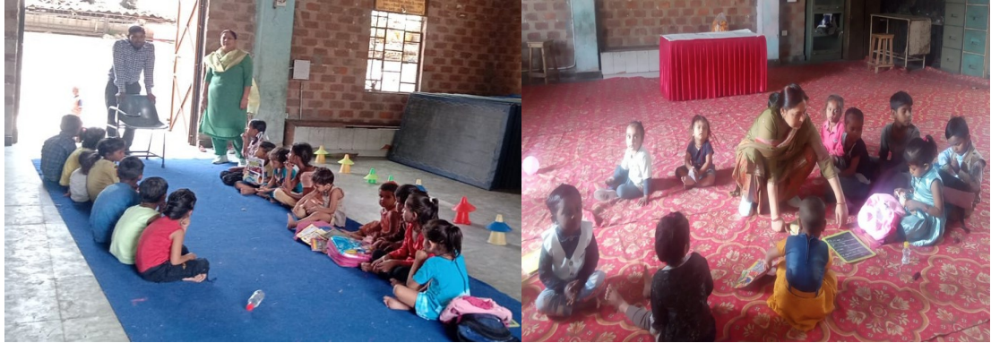
Creche Center at BVK, Shahabad Dairy, Delhi