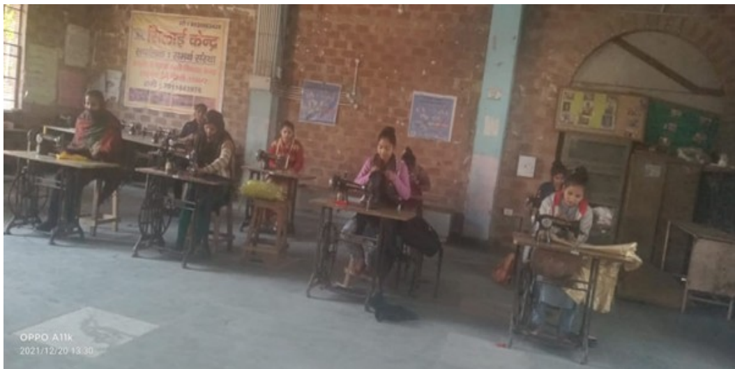
Learners are stitching

Venue of Skill Development Center: Basti Vikas Kendra, D- block Shahabad Dairy, Delhi-42