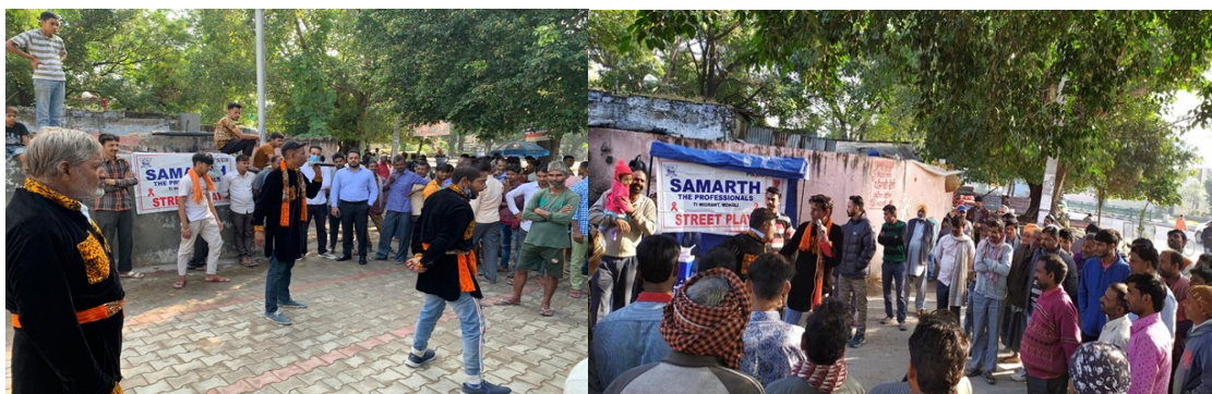
Awareness Program on HIV/AIDS-Street Plays at Labour Chowk, Mohali, Punjab