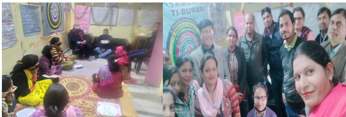
Review Meetings and NACO Team Visit at TI Project