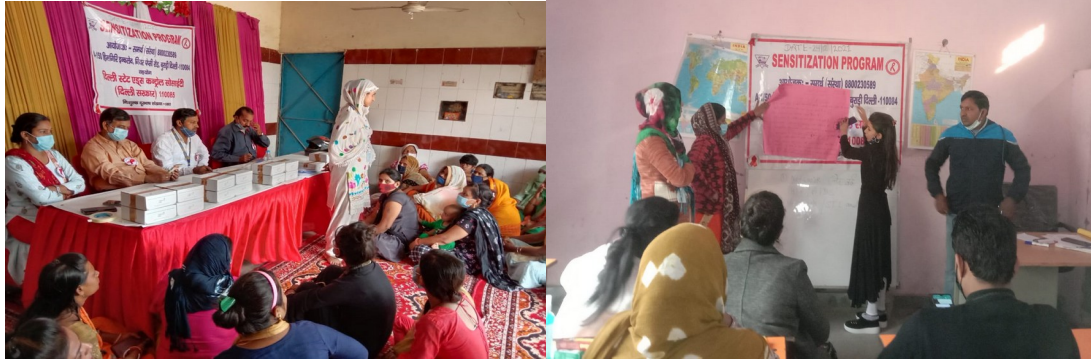
Sensitization Programs for Network Operators