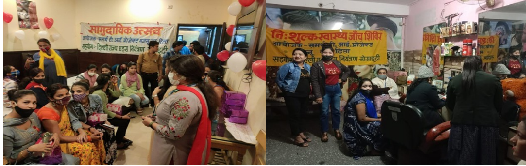
Community Events & Health Check-up Camps