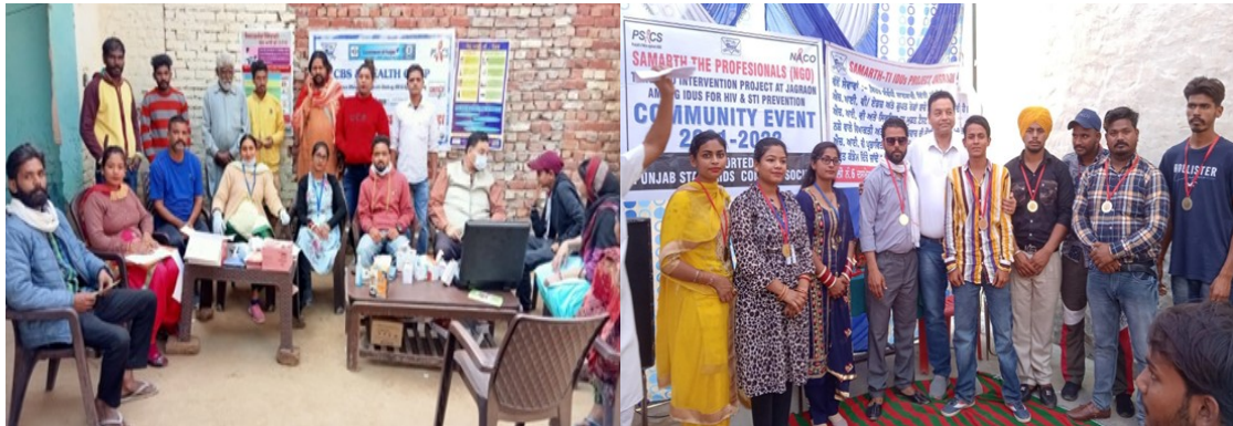
Health Camps & Community Events